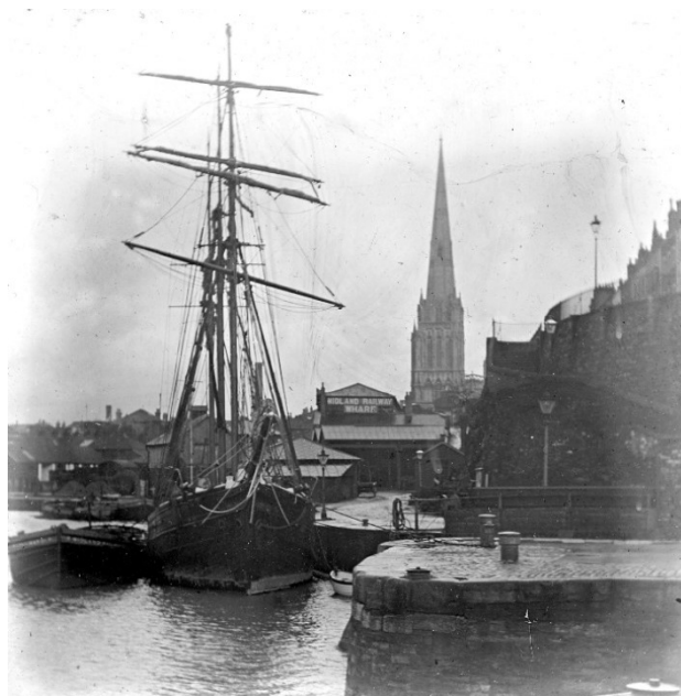
Bristol Museum & Art Gallery

In 1982 the building was carefully restored by the Scouts & Guides to retain its character. Since then it has been used by thousands of young people from the Bristol area, from all over the UK and from as far afield as USA and Canada. Its interesting character means the building often features in films and TV. It is also a meeting place for local community groups, including artists, actors, poets and photographers.